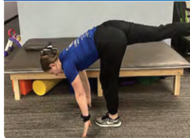
RDL - (10x each)