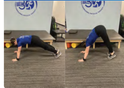
Inchworm - (8x)