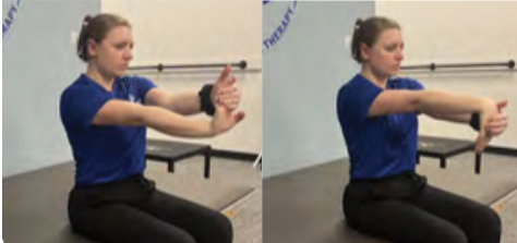
Wrist Flexion / Extension - (5x20)