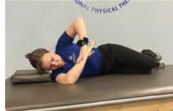
Sleeper Stretch - (5x20)