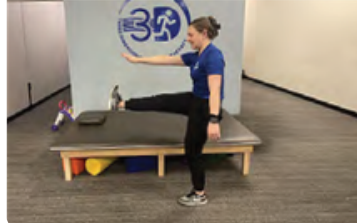
Hamstring Kick - (10x each)