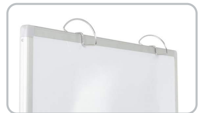
Hold easel paper pads and pocket charts