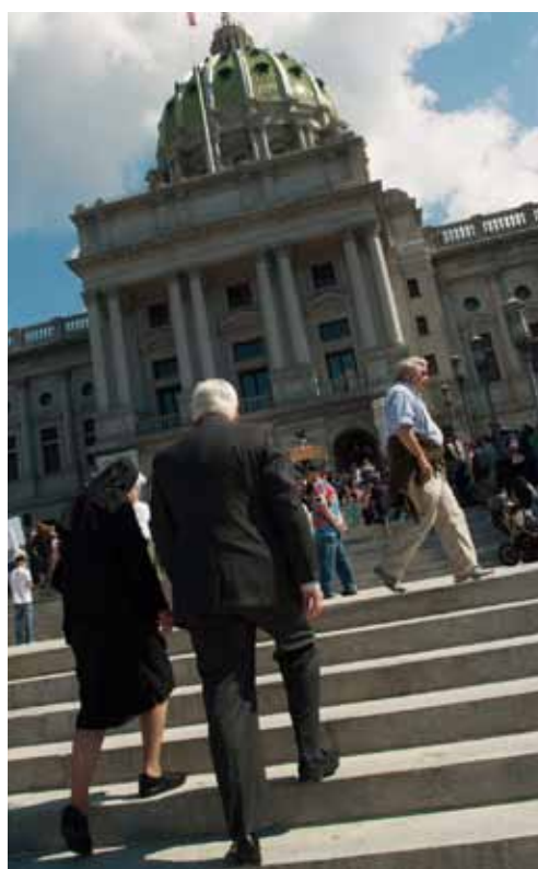
◀ Legislators, demonstrators, tourists, and lobbyists mingle on the Capitol steps.