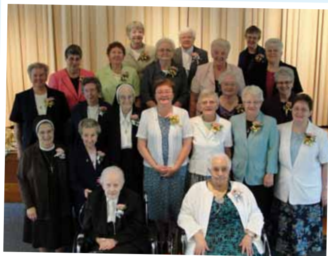
Meet our 2014 jubilarians!