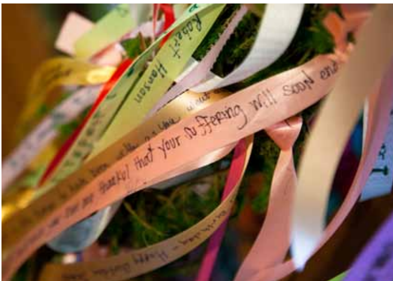
Strips of ribbon inscribed with thoughts by grieving friends and family are kept as mementos of each Hospice House patient.