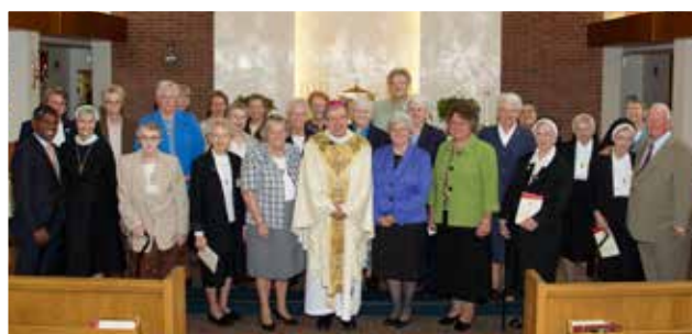
On Wednesday, October 1, 2014, a Mass was held for the Sisters of St. Francis of Philadelphia who founded St. Joseph Hospital/Medical Center in 1864.

developed the theme, “Sharing Faith, Fun, and Ministry,” with presentations on the role that each of these elements plays in who we are both as Christians and as women and men attempting to live out the gospel message in our lives. During the day participants had time for both personal prayer and reflection and for small group sharing on a variety of topics. The “fun” part of the day allowed time for gathering in small groups for games or for conversation. To learn more about our Companions in Mission program, visit http://www.osfphila.org/companions/about .