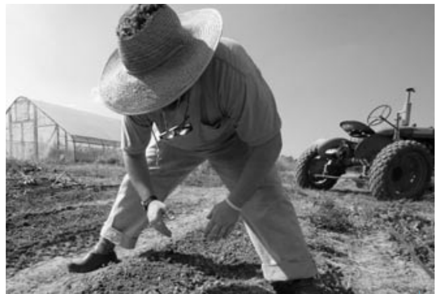
Here at Red Hill Farm in Aston, Pennsylvania, a grant will be used to provide solar energy panels for the barns.

For more information about the congregation's environmental initiatives, see www.osfphila.org/sp/resources/environment.html or contact us at environment@osfphila.org .