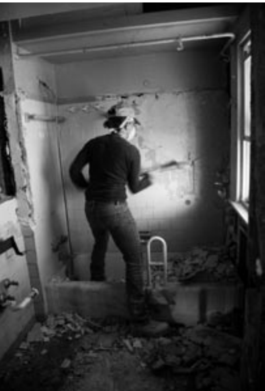
The work of gutting the houses was often slow and tedious, especially because the volunteers worked without power tools. Heavy boots, masks, and gloves protected against toxins and cuts. Almost everyone went home with a few bruises.