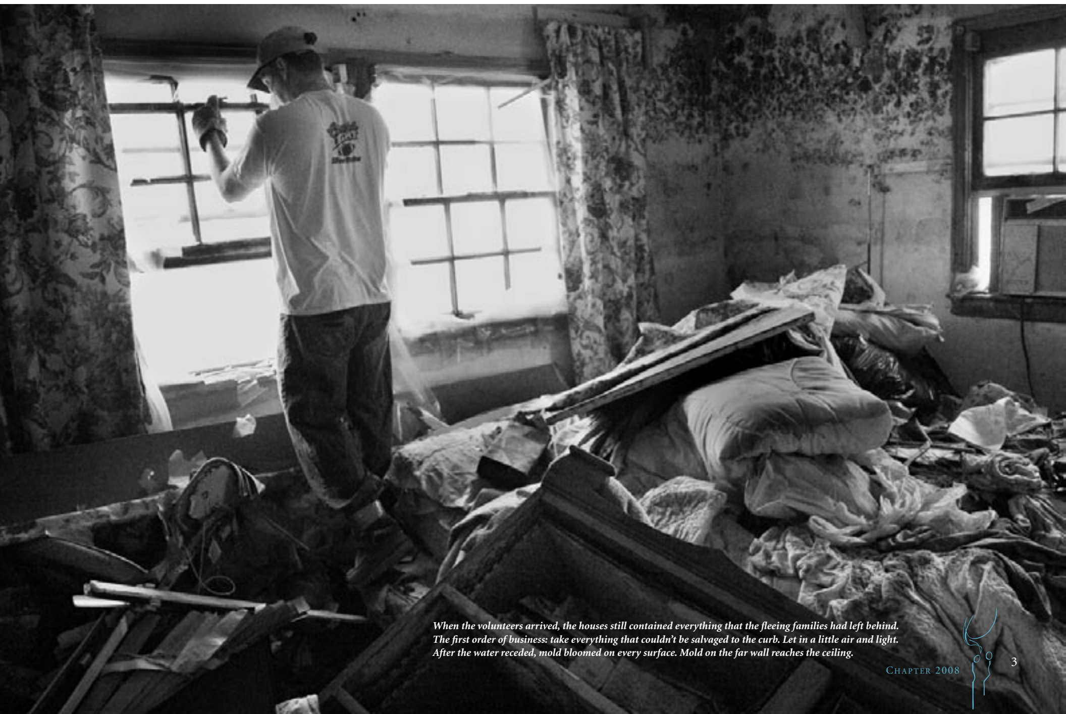
When the volunteers arrived, the houses still contained everything that the fleeing families had left behind. The first order of business: take everything that couldn't be salvaged to the curb. Let in a little air and light. After the water receded, mold bloomed on every surface. Mold on the far wall reaches the ceiling.

✧ ONE VOLUNTEER SAID, "I JUST HAD A CALLING...I DIDN'T KNOW WHAT I COULD DO BUT I KNEW I COULD DO SOMETHING."