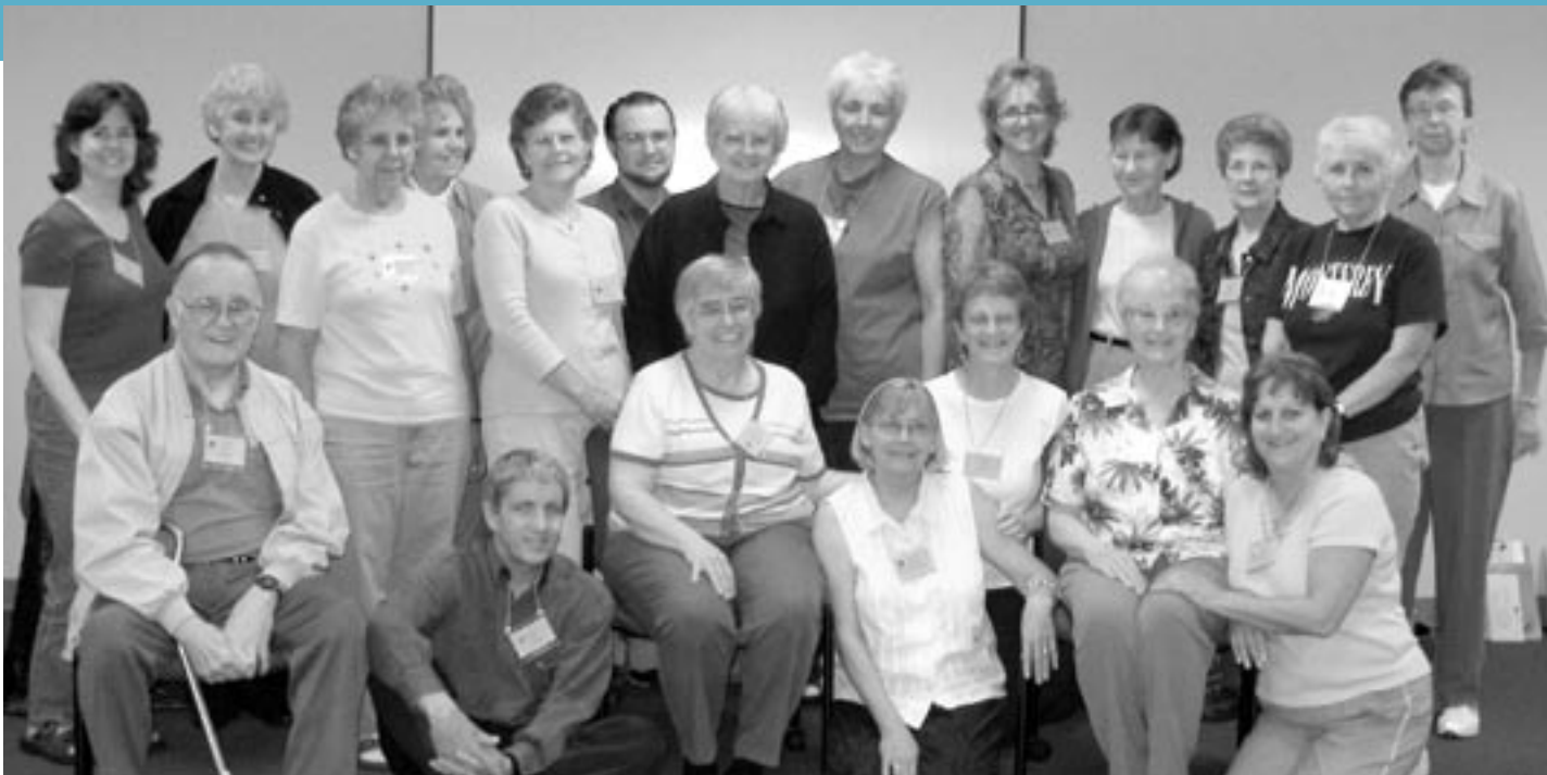
This Portland, Oregon, Companions in Faith group has grown—although new participants have joined, they also have grown as a community of women and men in their understanding of Franciscan Spirituality and in their understanding of their faith.

Congratulations to Sisters of St. Francis of Philadelphia celebrating milestones in religious life! This year, these sisters will celebrate Silver, Golden, and Diamond Jubilees. Join with us in congratulating them on many years of service to the people of God as Sisters of St. Francis.