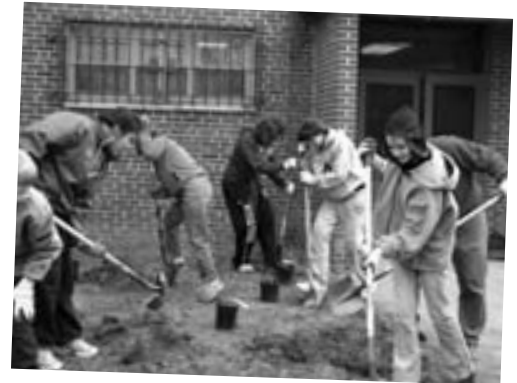
As part of TCHS' environmental efforts, students, parents, faculty, and staff worked together to create the school's outdoor classroom containing a sustainable garden using only native Maryland plants.

their 2009 graduation. The class far exceeded expectations. By sponsoring a Mission Fair; doing chores and donating the proceeds; selling t-shirts, baked goods, and roses; and a variety of other fundraisers, the school raised $5,000. Using the image gleaned from the story of Noah, the Ringwood students filled their "ark" two by two—and sometimes six by six—with ducks, llamas, sheep, water buffaloes, donkeys, cows, rabbits, geese, guinea pigs, goats, beehives, oxen, chicks, and camels. Organizers at Heifer International who coordinated the project commended the students for completing in two years what would normally require five years.