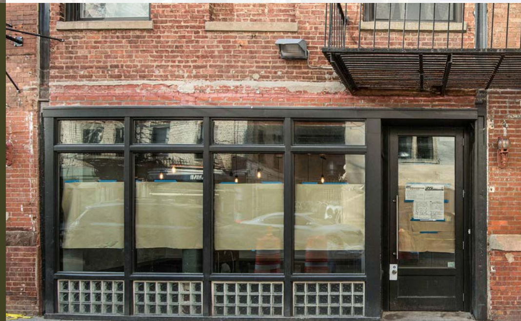
Sullivan Street Entrance